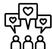
Direct end-user engagement