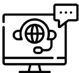
Assistance with tender responses & specifications