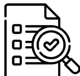
On-site POC testing