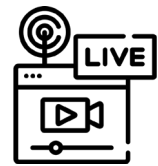
Pro AV & Broadcast Systems